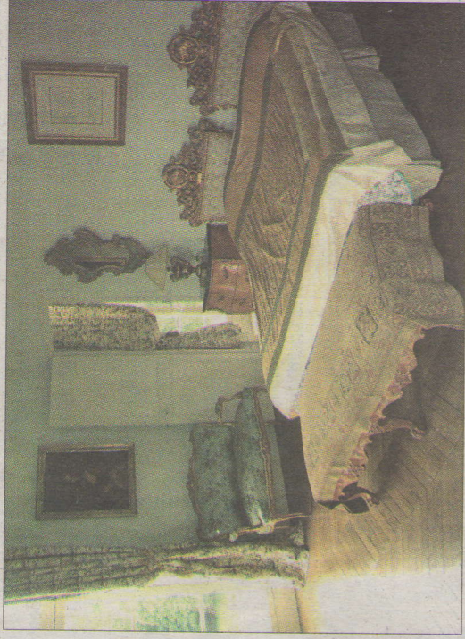
Sleep like royalty at Château de Villette, where some rooms have gilded headboards and overlook luxurious gardens.

Villette, France — When Voltaire and Lafayette dined within the honeyed stone walls of Château de Villette, they probably didn’t scarf down tomato and brie sandwiches off the paper they were wrapped in. But my humble sack lunch doesn’t detract from the silly thrill of sitting beneath a crystal chandelier